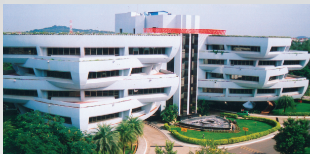
LEED Silver Rated Engineering Design and Research Centre, Chennai