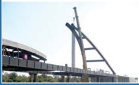
ROADS & BRIDGES